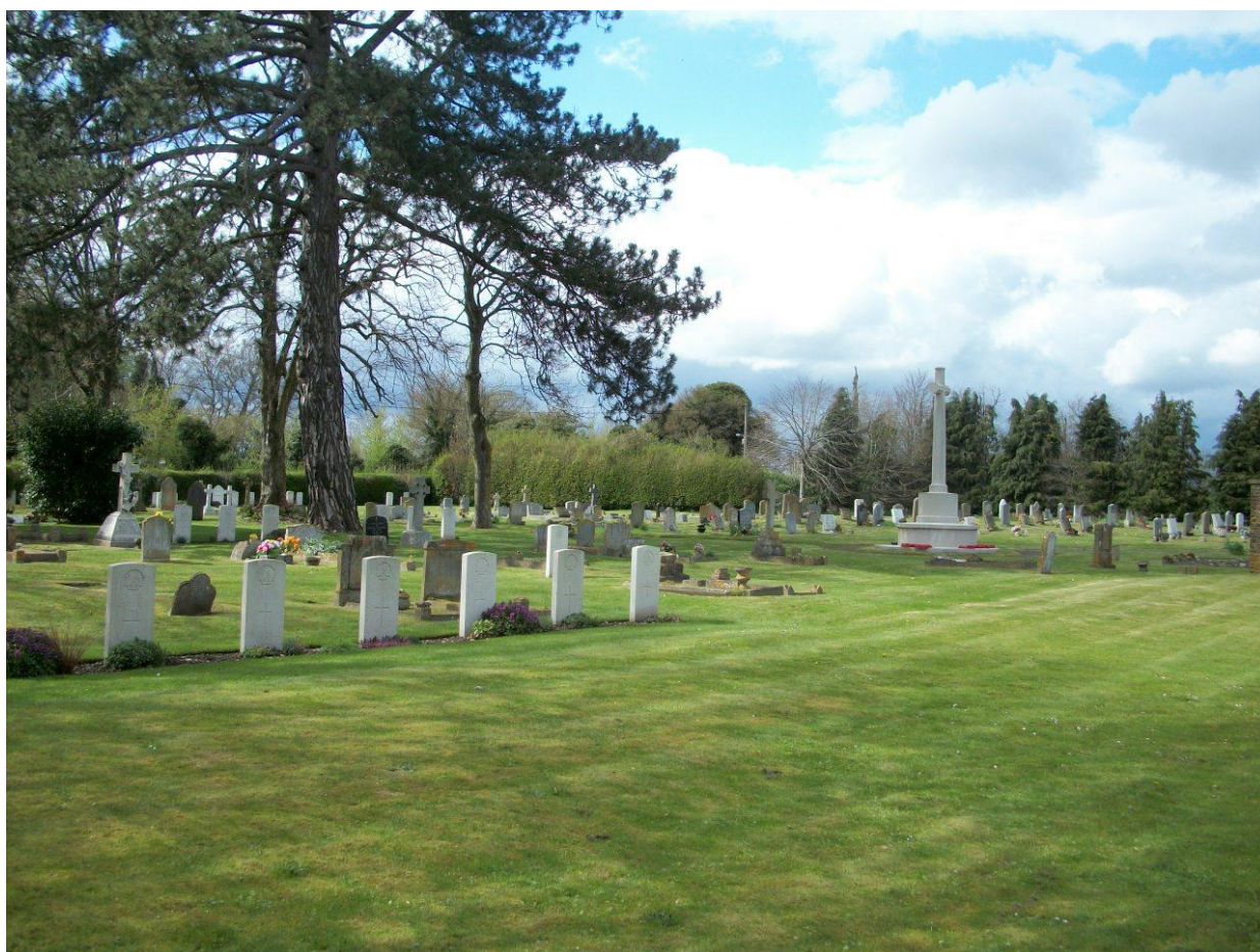
Bulford Church Cemetery